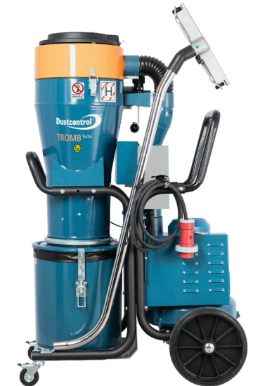
DC Tromb Turbo EX for ATEX zone 22