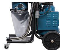
Plastic Bag (C)