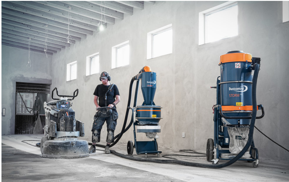
Various option for concrete floor grinding with Dustcontrol. Above you see a pre-separator DCF Storm L with the 3-phase dust extractor DC Storm 500 C.