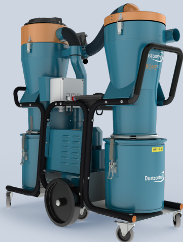
DC Tromb Turbo Twin AA with a container. Prod No 173320