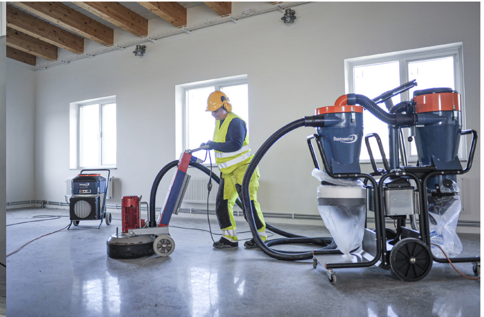
On this construction site a single-phase DC Tromb Twin LC is used for dust extraction accompanied with an air cleaner DC AirCube 1200.