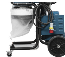
Steel Container (A)