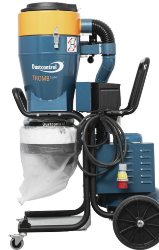
DC Tromb Turbo with VFD (Frequency Inverter)