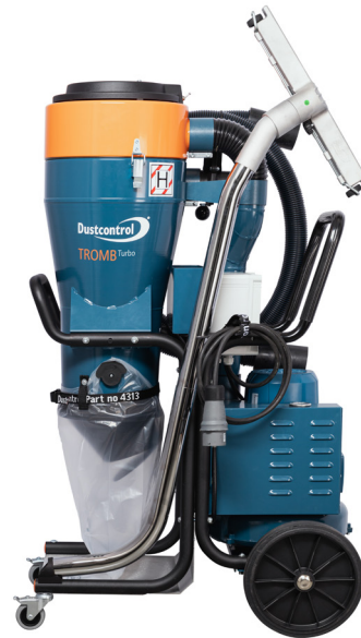
DC Tromb Turbo with Direct start